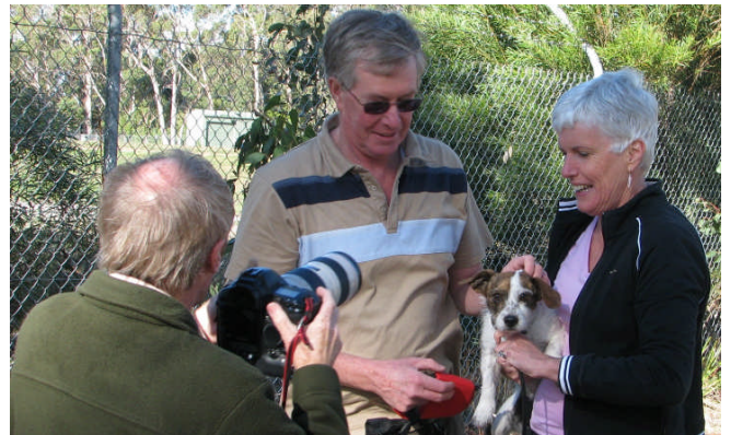
International Day of the Dog event